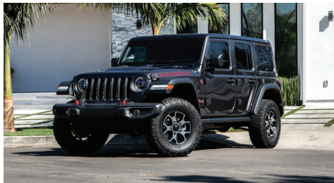
2018 JEEP, WRANGLER earns $65 per day*

Jeep® Brand vehicles are top earners on Turo!