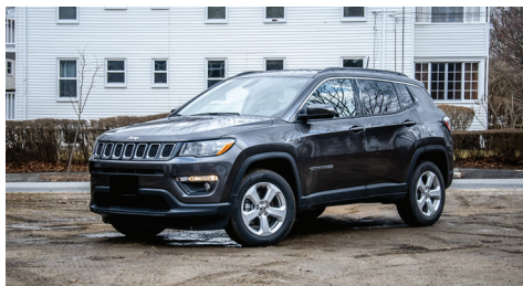
2018 JEEP, COMPASS earns $40 per day*