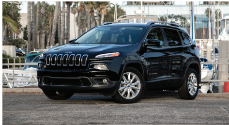
2018 JEEP, CHEROKEE earns $43 per day*