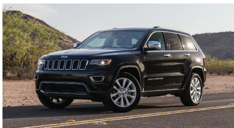
2018 JEEP, GRAND CHEROKEE earns $49 per day*

*Average daily earnings calculated for the entire US using the Turo Calculator